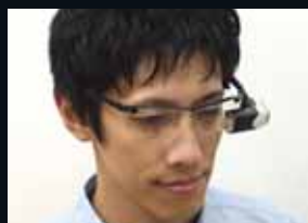
Brother Industries, Ltd.

www.brother.com/en/news/2009/rid/index.htm