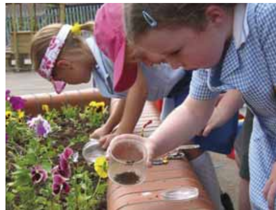
Learning to Learn