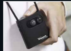
Vicon - Oxford Metrics Group Microsoft Research

www.vicon.com/company/releases/101509.htm