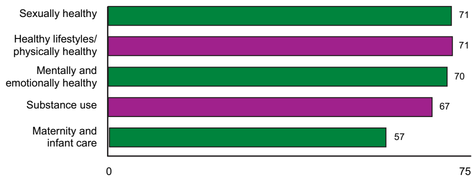
Figure 1 Coverage of 'Be Healthy' priority areas

Within the five 'Be Healthy' priorities, the following sub-priorities are referenced: