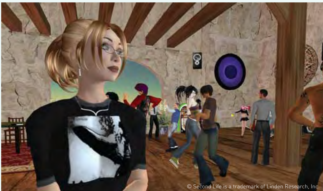
© Second Life is a trademark of Linden Research, Inc.

Second Life has a list of resources including an education mailing list, which gives teachers an opportunity to share information. There is also a Second Life Education Wiki: www.simteach.com/wiki/index.php?title=Second_Life_Education_Wiki .