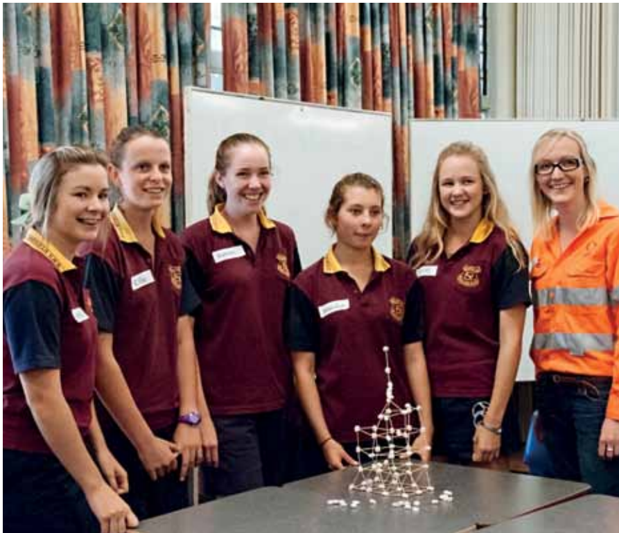
LEFT STUDENT PARTICIPATION DURING THE 2013 "POWER OF ENGINEERING" EVENT IN QUEENSLAND, PART-FUNDED BY QGC (A BG GROUP COMPANY)