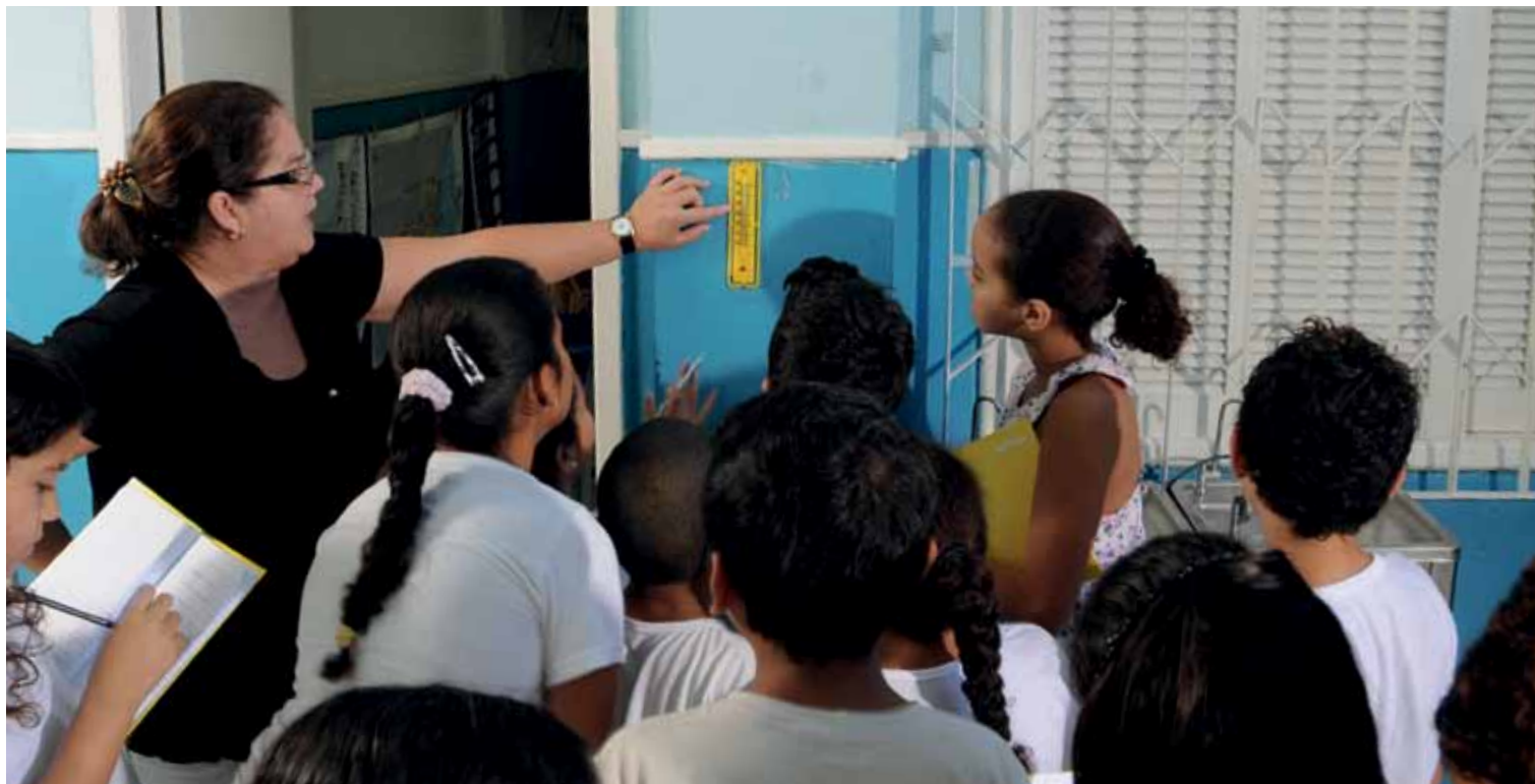
ABOVE ENQUIRY-BASED SCIENCE LEARNING THROUGH THE "SCIENCE AND TECHNOLOGY WITH CREATIVITY" PROGRAMME IN ANGRA DOS REIS, SUPPORTED BY BG BRASIL