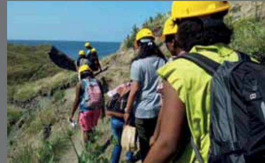
BELOW GEOLOGY FIELD WORK DURING THE BG GROUP EARTH AND MARINE SCIENCE SUMMER SCHOOL