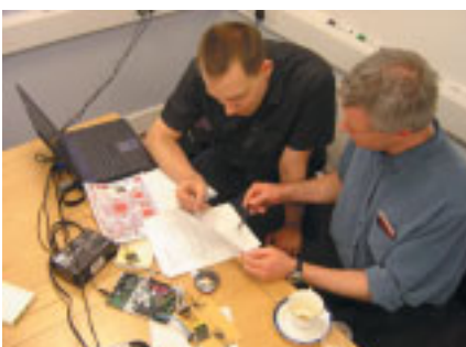
Technology Bespoke wrist device developed by the Research Consortium in Speckled Computing.