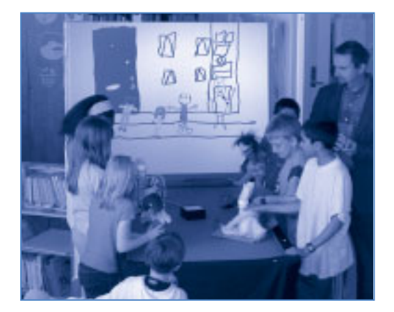
Fig 5: RFID tags were embedded in physical story props and characters and used to navigate digital stories in the KidStory project.

In the KidStory project referred to earlier, RFID tags were embedded in toys as story characters. When the props were moved near to the tag reader it triggered corresponding events involving the characters on the screen (Fig 5).