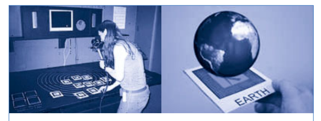
Fig 2: These images show the MagiPlanet application developed at the Human Interface Technology Laboratory New Zealand<sup>3</sup> (Billinghurst 2002).

Imagine a Year 5 teacher is trying to help her class understand planetary motion. They are standing around in a circle looking down on a table on which are marked nine orbital paths around the Sun. The children have to place cards depicting each of the planets in its correct orbit. As they do, they can see overlaid onto the cards a 3D animation of that planet spinning on its own axis and orbiting around the Sun. They can pick up the card and rotate it to see the surface of the planet in more detail, or its moons.