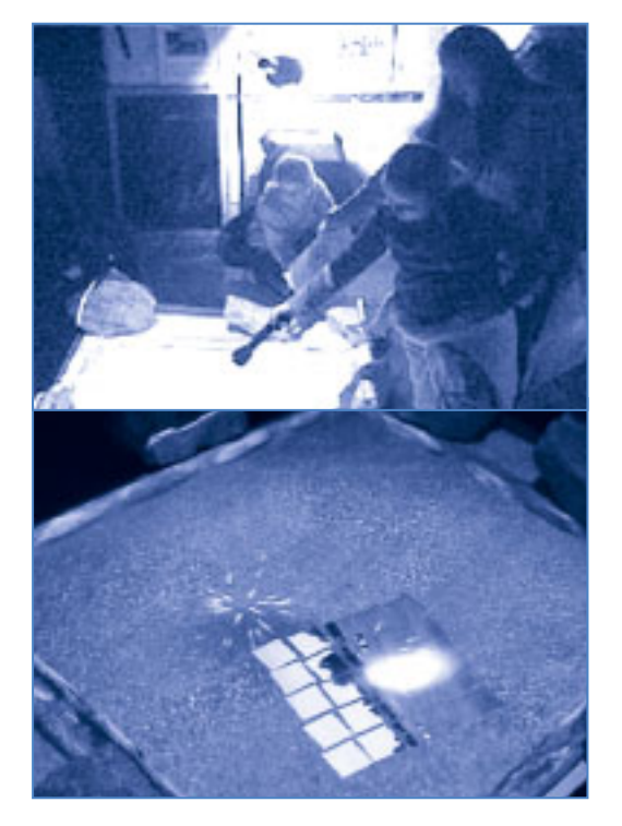
Fig 7: A torch being used to interact with a display in the Shape project.

A device for tangible storytelling involves the use of ordinary flashlights or torches to interact with a display. For example the Storytent (Green et al 2002) used flashlights to manipulate objects on a tent which had a 3D virtual world displayed on it. The same technology was used in a different application within the Shape project mentioned earlier to trigger audio clips on the wall of the underground caves in Nottingham Castle, enabling users to play sequences of such audio clips to hear about the history of the caves as it happened at the very location where they shone the flashlight (Ghali et al 2003)<sup>21</sup>. A third example of the use of flashlights as tangible technologies was to interact with a digital Sandpit - a floor projection showing virtual 'sand'. As users collaboratively shone their flashlights on the sand it burned a virtual hole through the surface to reveal images beneath, telling the history of Nottingham Castle (Fraser et al 2003).