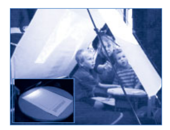
Fig 4: Child and adult in the Storytent with close-up of turntable (inset).

simulation of the castle as it was in medieval times.