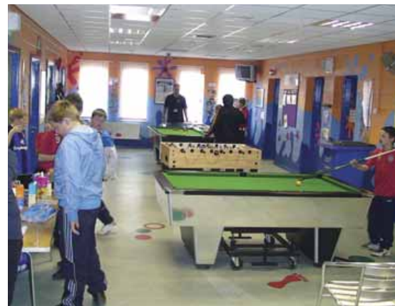
Pennywell Youth Project