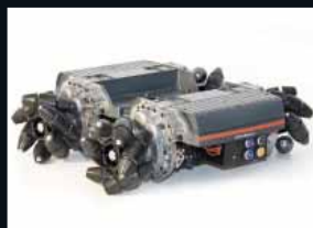
Segway/Inc - RMP

www.segway.com/business/products-solutions/robotic-mobility-platform.php