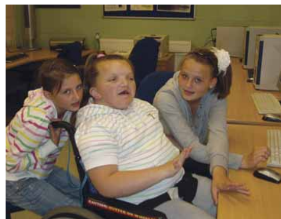
Pennywell Youth Project