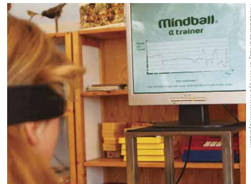
Mindball: courtesy of Vivifeye www.vivifeye.com