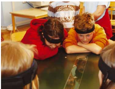
Mindball

Another example that uses the neurofeedback principle is EmotivEPOC, a computer fantasy game in development by the American company Emotiv Systems. Wearing a headset with 14 electrodes attached to it, players can control and manipulate objects and change environments according to their emotional state. Furthermore, the creatures in the game react to players’ facial expressions in real time. Another is the NASA-inspired educational system Play Attention, available in the UK from Games for Life, which is aimed at children suffering from Attention Deficit Hyperactivity Disorder