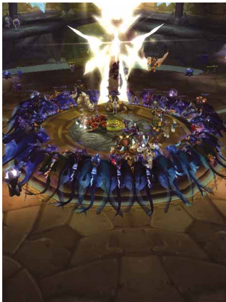
Both images World of Warcraft: Blizzard Entertainment, Inc