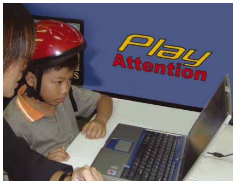
Games for Life