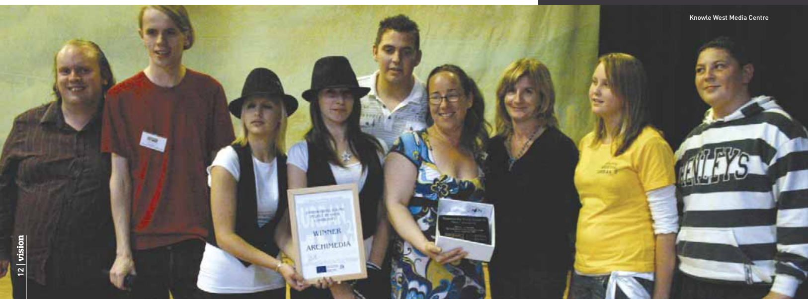
Knowle West Media Centre

For more information, go to www.futurelab.org.uk/projects/adult-informal-learning .