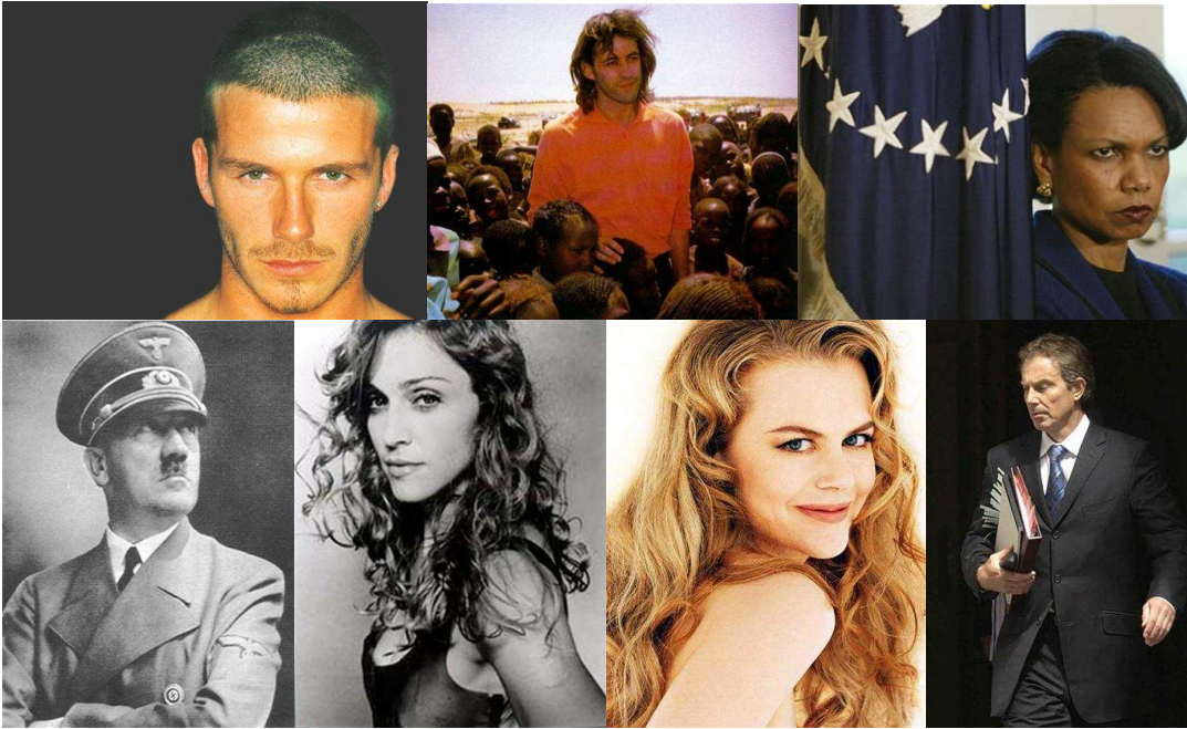
Fig 5: 'Power' posters used in trial

These images were shown to students and discussed as a whole class prior to using the World Power League in order that they might begin thinking about various different uses and abuses of power, what it means for someone to have power, and how they gain power.