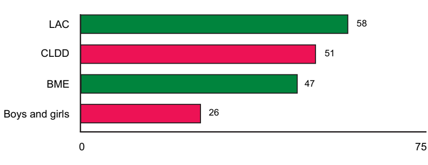
Figure 3 Prevalence of LAC, CLDD and BME in CYPPs in relation to 'Enjoy and

The analysis shows that, across all the five ECM outcome areas, the four most commonly mentioned key groups are, in order of frequency, LAC, CLDD, BME pupils and boys and girls (see Figure 3).