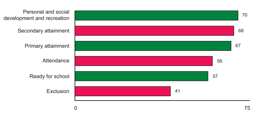
Figure 1 'Enjoy and Achieve' priority areas

Within the CYPPs, the themes addressed under 'Enjoy and achieve' map on to the aims identified within the ECM outcomes framework and therefore fall into six main areas. As shown in Figure 1, reference to the six priorities varies across plans, as does the coverage of the sub-areas within them (see Figure 2). It should be noted that the figures here include all references in the plans to these areas as 'priorities'. However, there is considerable differentiation in the extent to which the priorities were addressed within each area.