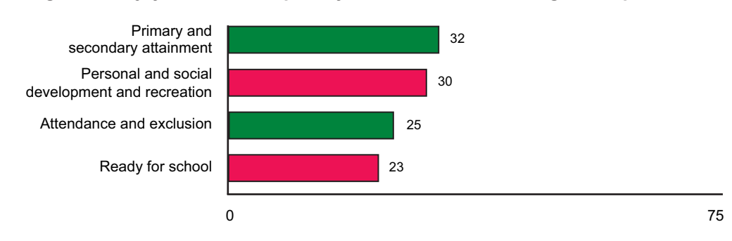
Figure 4 'Enjoy and Achieve' priority areas in which a lead agent is specified

Overall, just over half of the plans explicitly identify a lead agent responsible for specified actions (in one or more of the 'Enjoy and achieve' priority areas), most frequently in relation to primary and secondary attainment (as shown in Figure 4).