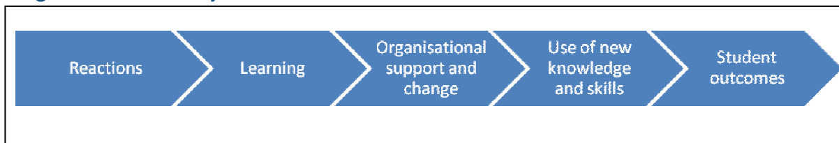
Figure 1: Guskey's 'Five critical levels of evaluation'

this model, Guskey proposes that teachers go through a process of understanding their own reactions, learning and development en route to 'higher' levels of changes to practice and, indeed, to student learning outcomes (see Figure 1 below).