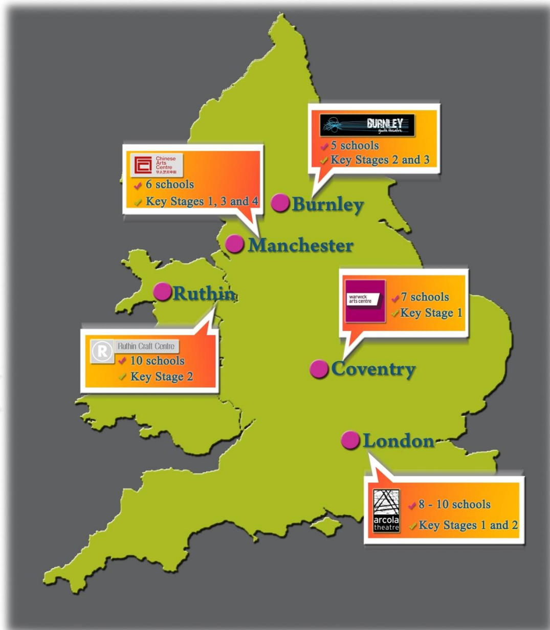
Figure 1: Case-study participation in Start